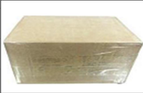
Pic No. 2